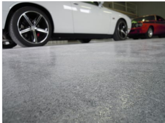
CSI Division 9: Finishes - Flooring